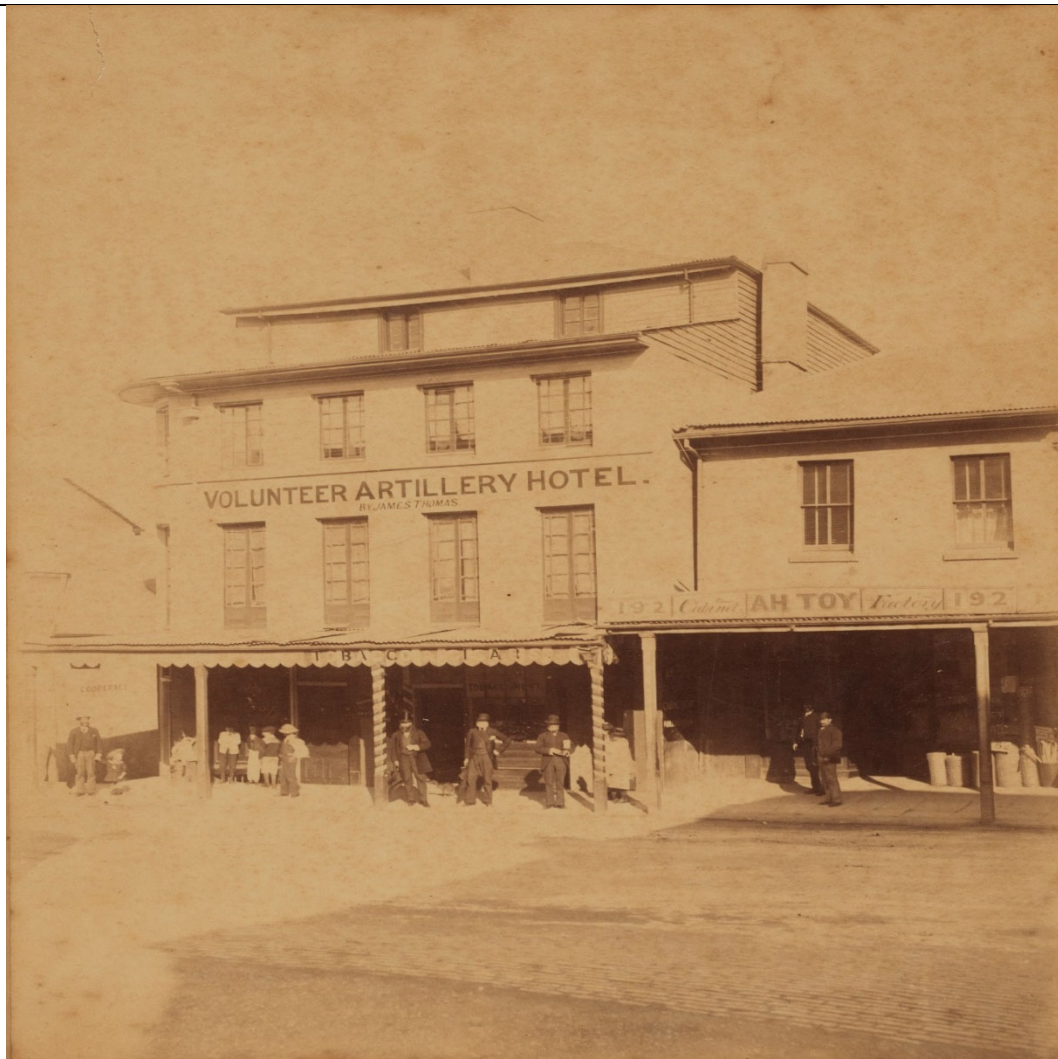
Ah Toy's Cabinet Factory, 192 Lower George Street.

Date: c.1885